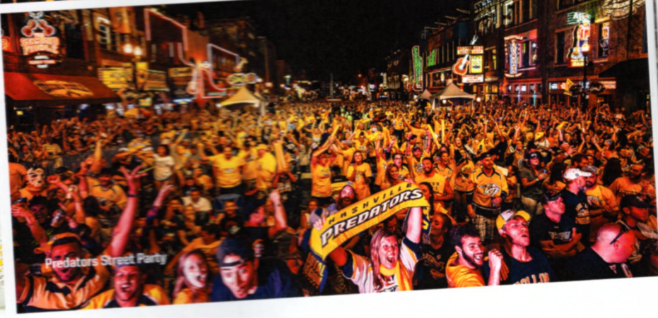
Predators Street Party

leading the charge to keep them. And, actually, that whole process is what led to the new ownership group and all the stuff that really made things work.