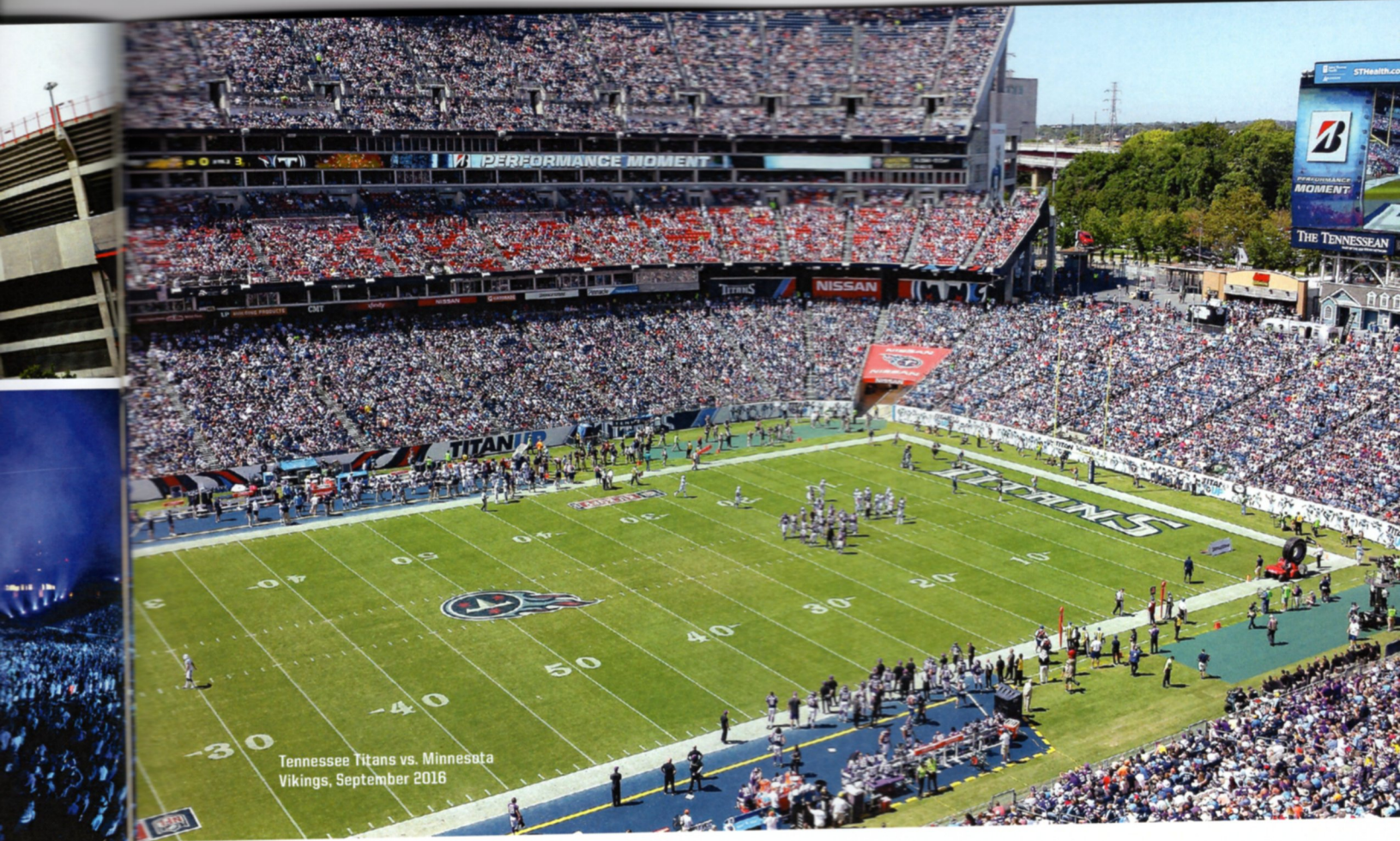
Tennessee Titans vs. Minnesota Vikings, September 2016