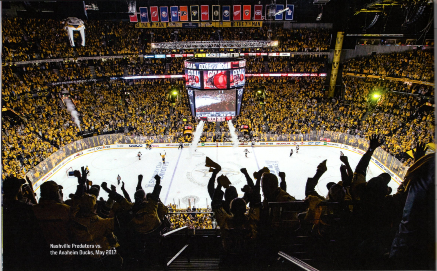
Nashville Predators vs. the Anaheim Ducks, May 2017