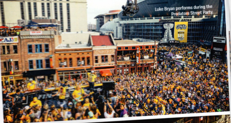
Luke Bryan performs during the Predators Street Party