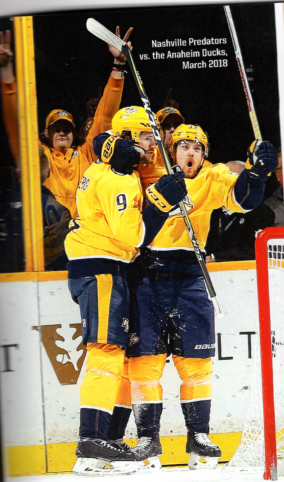
Nashville Predators vs. the Anaheim Ducks, March 2018