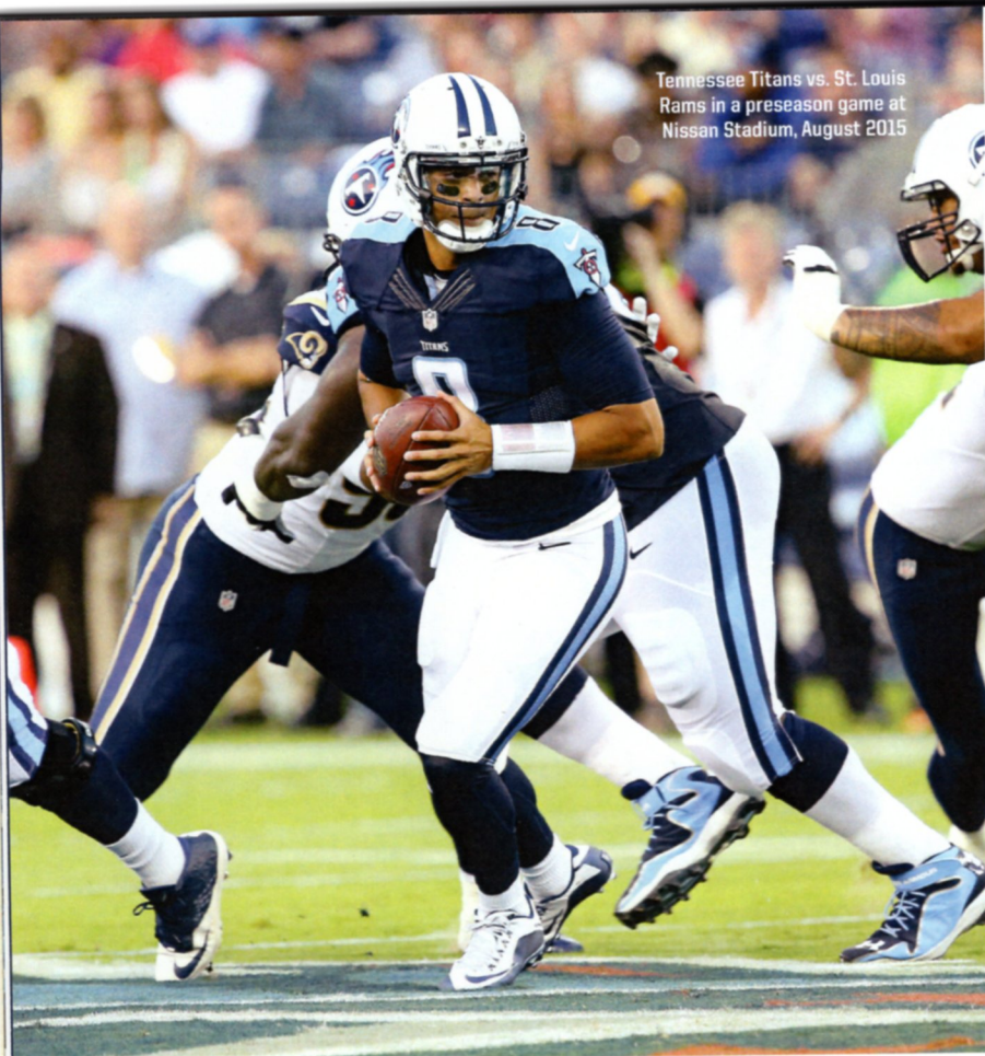
Tennessee Titans vs. St. Louis Rams in a preseason game at Nissan Stadium, August 2015